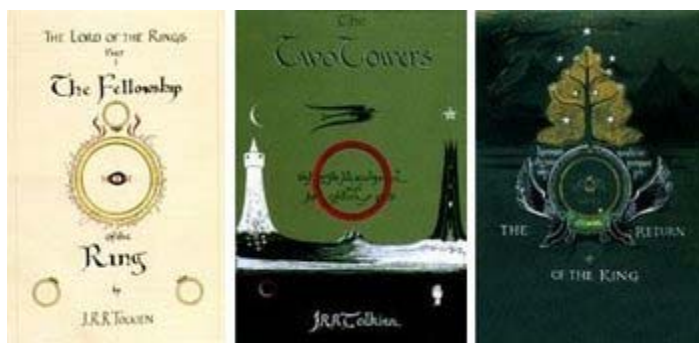
Cover design for the three volumes of The Lord of the Rings by J.R.R. Tolkien

United Artists never made a film, though at least John Boorman was planning a film in the early seventies. It would have been a live-action film, which apparently would have been much more to Tolkien's liking than an animated film. In 1976 the rights were sold to Tolkien Enterprises, a Saul Zaentz company, and the first movie adaptation (an animated rotoscoping film) of The Lord of the Rings appeared only after Tolkien's death (in 1978, directed by Ralph Bakshi). The screenplay was written by the fantasy writer Peter S. Beagle. This first adaptation, however, only contained the first half of the story that is The Lord of the Rings . In 1977 an animated TV production of The Hobbit was made by Rankin/Bass, and in 1980 they produced an animated film titled The Return of the King , which covered some of the portion of The Lord of the Rings that Bakshi was unable to complete. In 2001-3 The Lord of the Rings was filmed in full and as a live-action film as a trilogy of films by Peter Jackson.